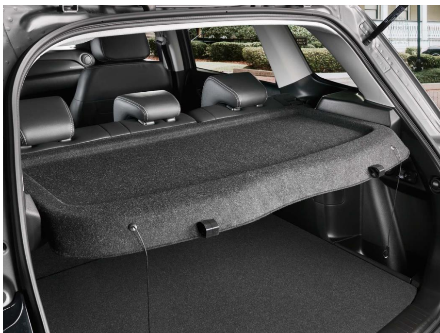
Suzuki Vitara Rear Shelf in RENOLIT TECNOGOR .

www.renolit.com | Twitter | Facebook | Linkedin