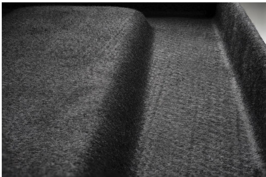
A finished part made of RENOLIT TECNOGOR does not release any fibers.